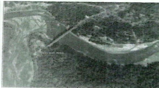
Tomor Nadi Plan